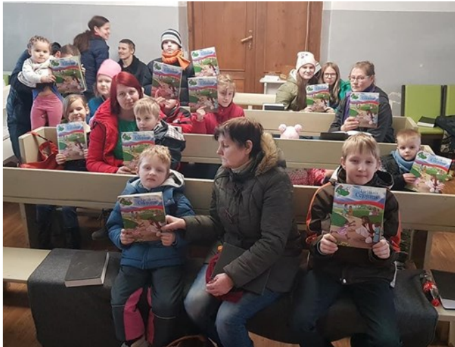
in Kolka boarding school and Upesgriva grade school.